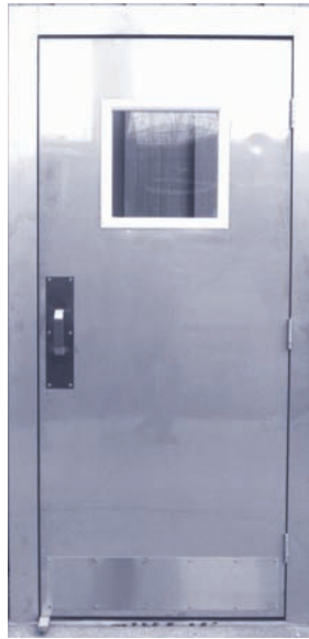
MODEL 1120 S

Shown with optional window and kickplate