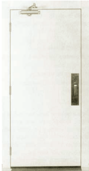
MODEL 1120 W