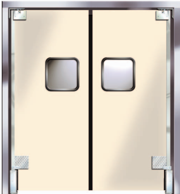
Picture shown has optional 14" X 16" vision panel, and 10" jamb guards

Versatile door for personnel and non-motorized traffic.