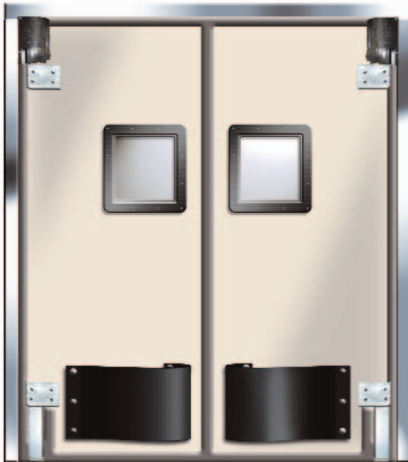
Picture shown has optional 14" X 16" vision panel, 18" teardrop bumpers, and 10" jamb guards