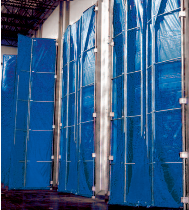
INSULATED VINYL DOOR PANELS